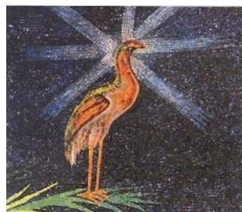
The phoenix, a mythical bird that rose from its ashes, was considered a Christian symbol of resurrection. The magnificent sixth-century mosaic of the phoenix, above, adorns the apse of the Church of SS. Cosmas and Damian in Rome.