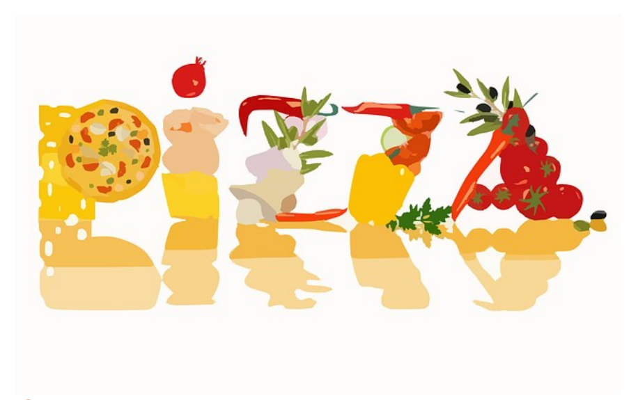
Come Join the Fun!