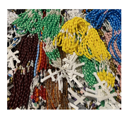
Rosaries made by the ladies of our rosary ministry!