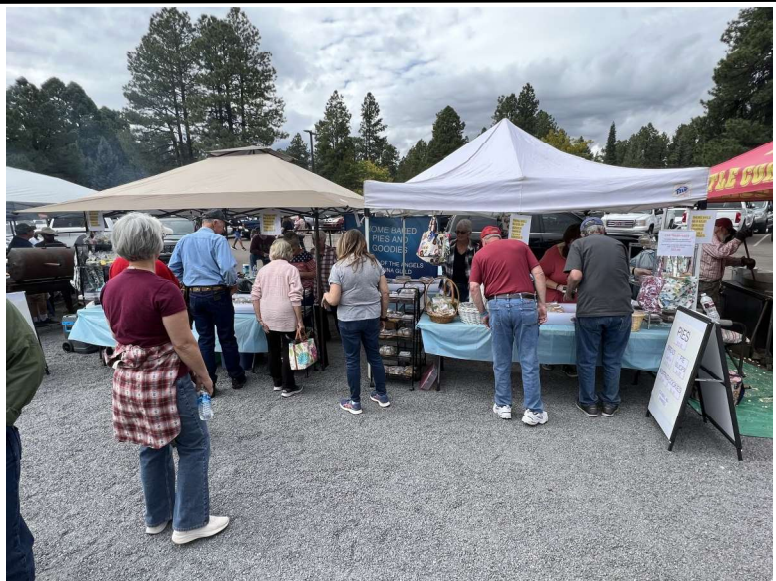
A BUSY DAY AT THE BAKE SALE!